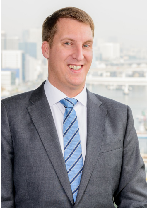
Dutch National born on the 4th of August 1979